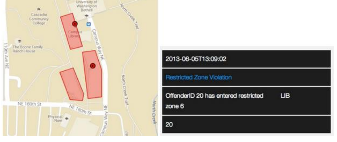
Figure 2. Restricted Zone Alert, triggered when a criminal enters a restricted zone.

The criminal justice system uses GPS systems to continuously track specific types of offenders. These offenders are forced by law to wear ankle bracelets that stream their locations to the monitoring agencies. This demo presented a real time data stream processing system that collects the location data of offenders. The system